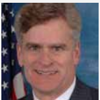
Bill Cassidy (R) - Congressman, Ex-State Sen. & Physician