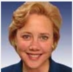
Mary Landrieu (D)

Primary November 4 - 2014 — General Election is December 6 - 2014 Candidates List in this Year's Senatorial Election